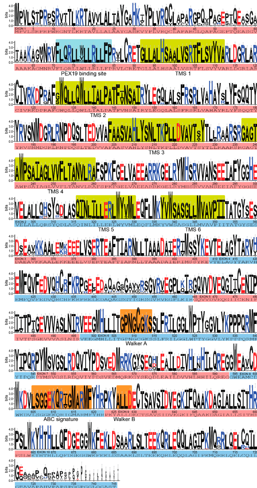
Figure 3. The evolutionary conservation of each amino acid within the ABCD1 protein based multiple sequence alignment among 54 different species. The overall height of each symbol represents the relative frequency of each amino acid at that position. Positively charged amino acids (KRH) are in blue; negatively charged amino acids (DE) are in red. Exons are indicated in alternating blue–pink–blue, etc.; the PEX19-binding site is indicated in blue; the 6 transmembrane segments are indicated in green; Walker A and B and the ABC signature are indicated in orange. Error bars indicating an approximate Bayesian 95% confidence interval are indicated in grey.