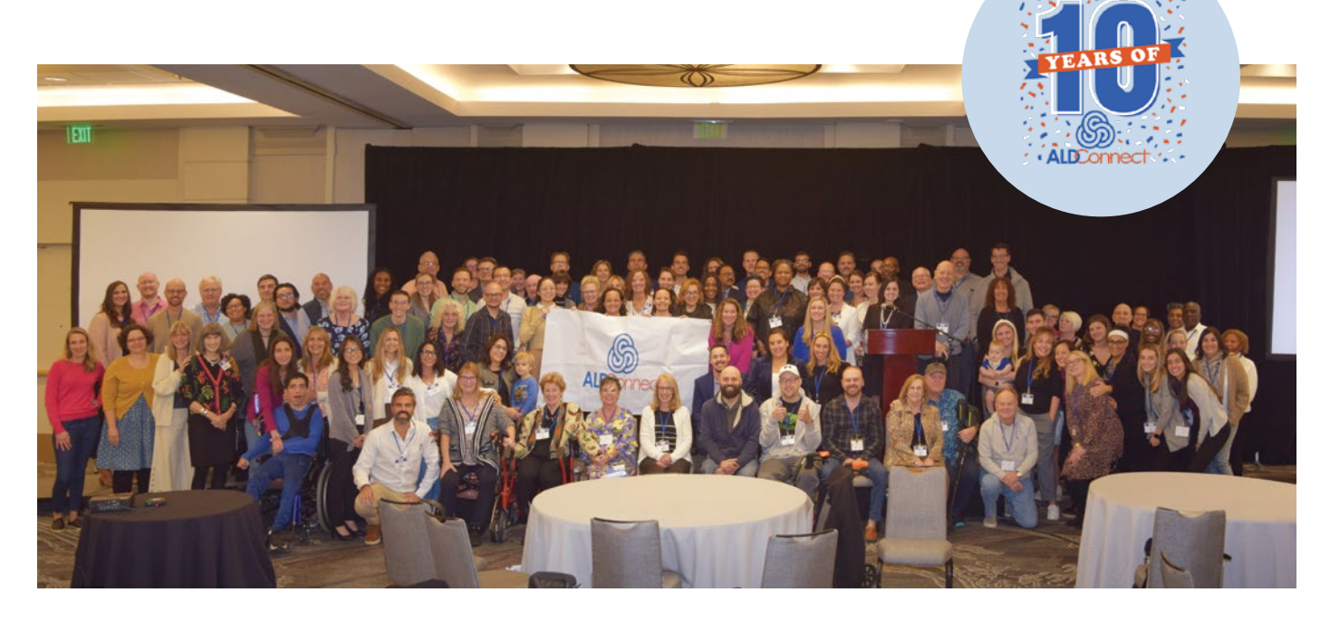
2023 Annual Meeting and Patient Learning Academy